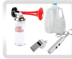
NO NOISEMAKERS NO LASER POINTERS