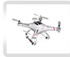
NO UNMANNED AERIAL VEHICLES