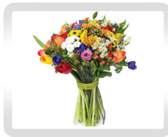
FLOWERS (no glass vase)