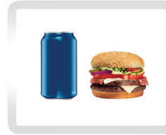
NO FOOD OR BEVERAGES