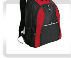
NO BAGS LARGER THAN 8.5" x 11" (INCLUDING BACKPACKS)