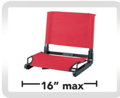
CHAIRBACKS not more than 16" wide