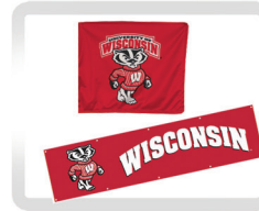
NO FLAGS, BANNERS, SIGNS