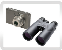
BINOCULARS & CAMERAS