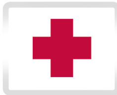
ITEMS RELATED TO A MEDICAL CONDITION