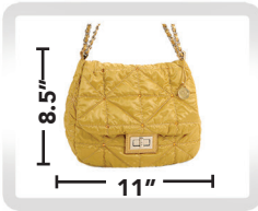
BAGS No larger than 8.5" x 11"