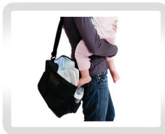
DIAPER BAGS WITH CHILD