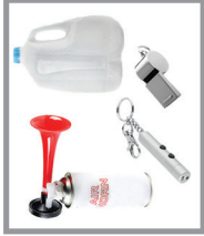
NO NOISEMAKERS NO LASER POINTERS