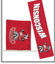
NO FLAGS, BANNERS, SIGNS