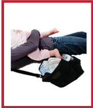
DIAPER BAGS WITH CHILD