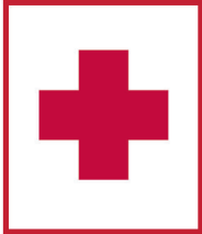
ITEMS RELATED TO A MEDICAL CONDITION

Items prohibited (including, but not limited to): Bags larger than 8.5" x 11" (including backpacks), food, beverages, containers, strollers, baby carriers, laser pointers, banners, flags, signs, noisemakers, nooses, ropes, weapons, replicas of weapons, inflatables, video recorders, monopods, tripods, selfie sticks, drones or any items deemed dangerous or inappropriate.