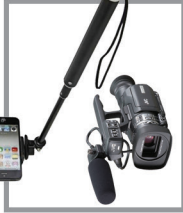
NO VIDEO RECORDERS NO SELFIE STICKS