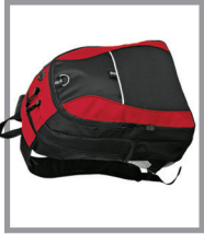
NO BAGS LARGER THAN 8.5" x 11" (INCLUDING BACKPACKS)