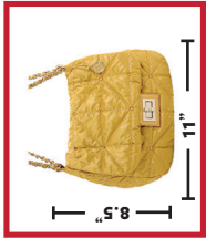
BAGS No larger than 8.5" x 11"