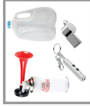
NO NOISEMAKERS NO LASER POINTERS