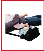
DIAPER BAGS WITH CHILD