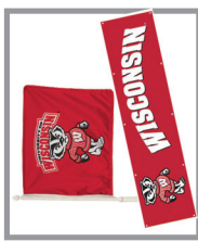
NO FLAGS, BANNERS, SIGNS