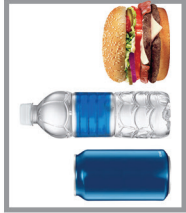
NO FOOD OR BEVERAGES