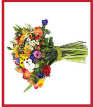
FLOWERS (no glass vase)