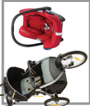
NO STROLLERS NO BABY CARRIERS