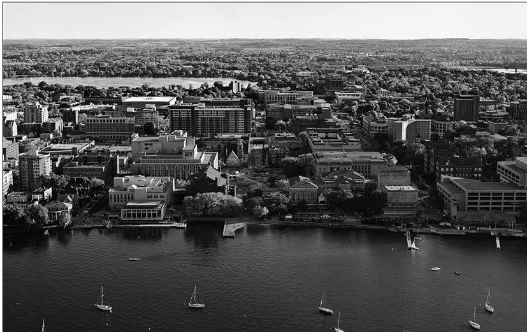
Lake Mendota shoreline

We are motivated by the “Wisconsin Idea”—articulated a century ago as the principle that the university’s influence should benefit everyone in the state. Today, this principle has expanded to a global scale. The Wisconsin Idea continues to permeate everything we do, helping to forge close partnerships between faculty, staff, and students, and people, communities, and industries around the world.