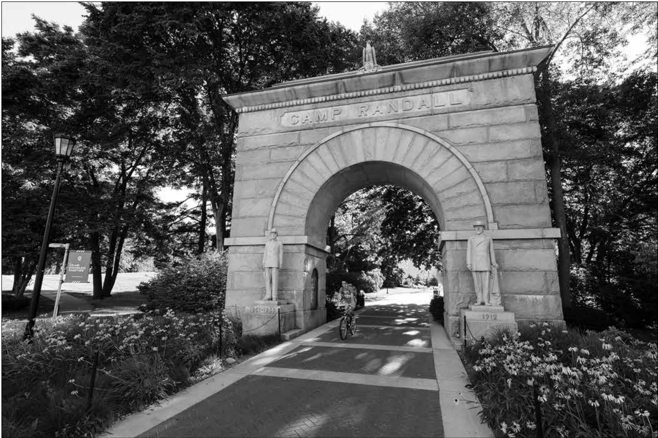
Camp Randall Memorial Arch