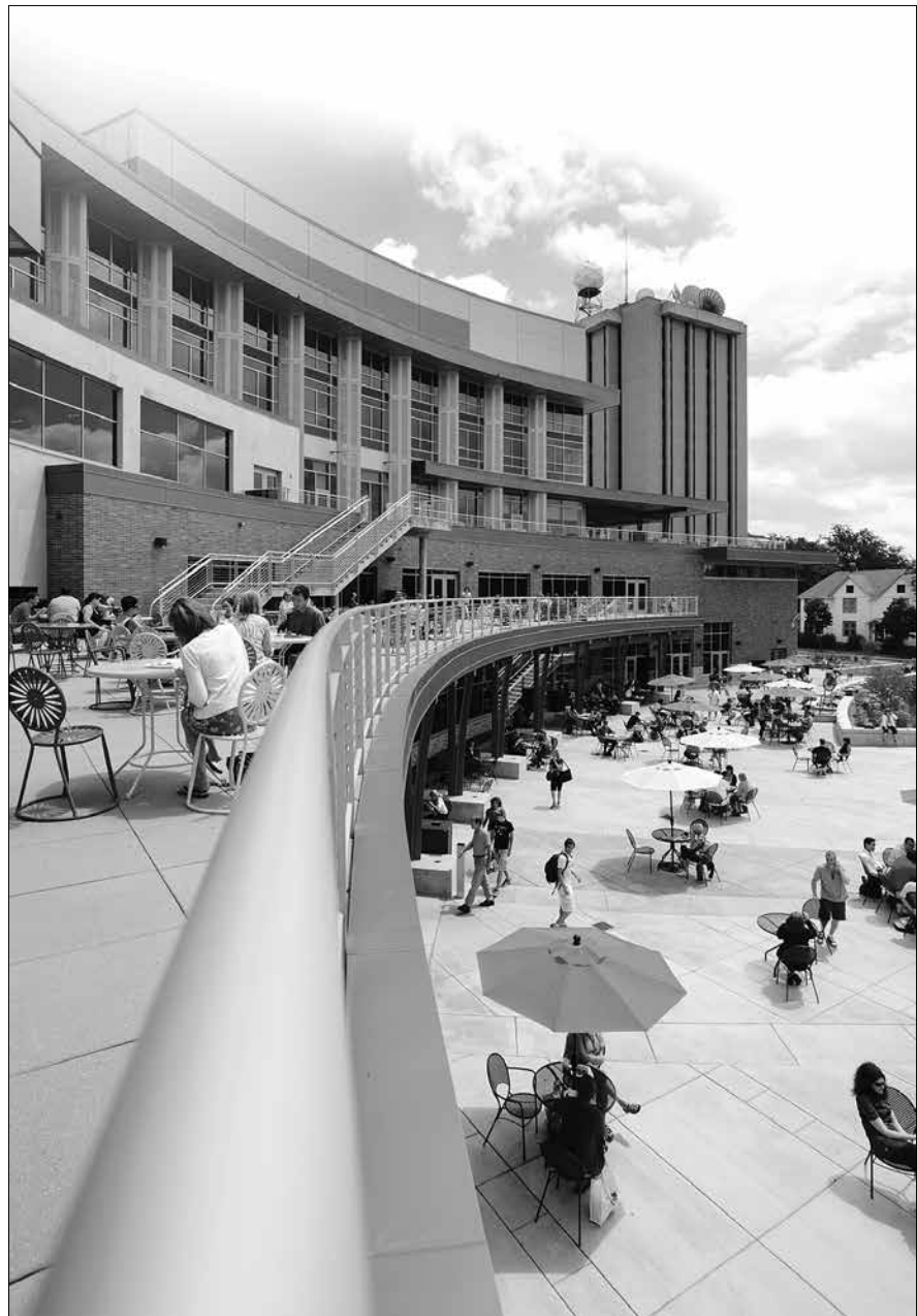
The Plaza at Union South