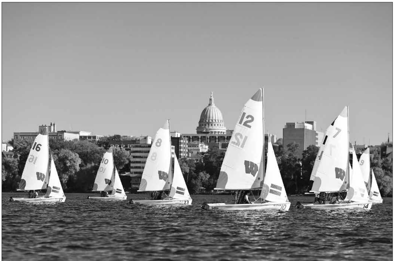
Sailing competition on Lake Mendota