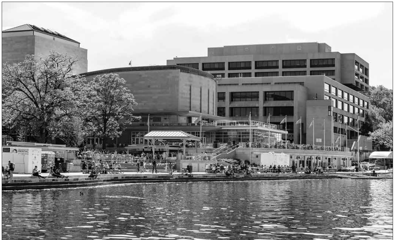
Memorial Union Terrace