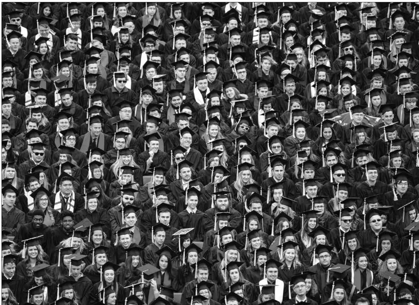
Commencement at Camp Randall