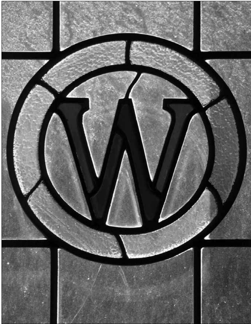
Stained glass "W" emblem window at the University Club