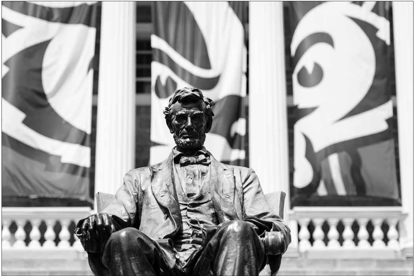
Abraham Lincoln statue on Bascom Hill