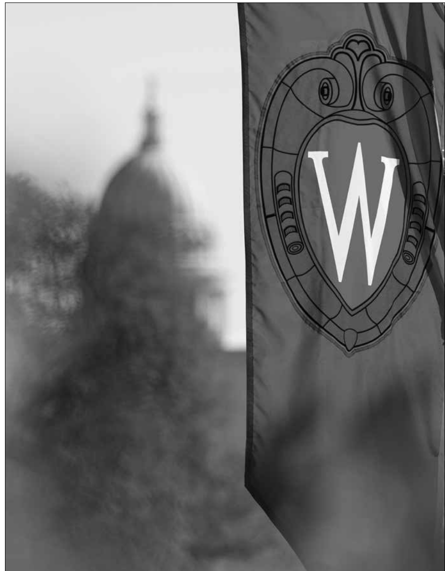
Banners on Bascom Hill