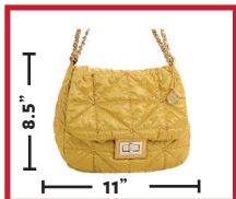
BAGS No larger than 8.5" x 11"