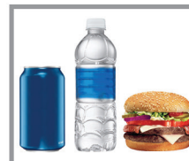
NO FOOD OR BEVERAGES