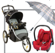
NO STROLLERS, NO BABY CARRIERS, NO UMBRELLAS