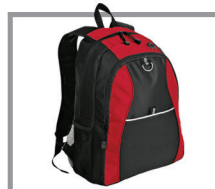
NO BAGS LARGER THAN 8.5" x 11" (INCLUDING BACKPACKS)