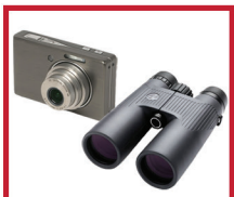
BINOCULARS & CAMERAS