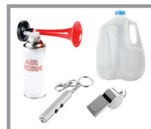
NO NOISEMAKERS NO LASER POINTERS