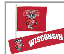
NO FLAGS, BANNERS, SIGNS