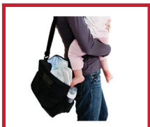
DIAPER BAGS WITH CHILD