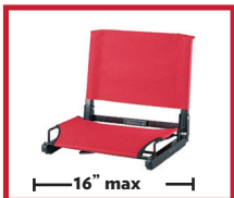
CHAIRBACKS not more than 16" wide