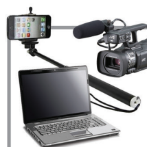
NO LAPTOPS, NO VIDEO RECORDERS NO SELFIE STICKS