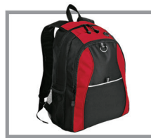
NO BAGS LARGER THAN 8.5" x 11" (INCLUDING BACKPACKS)