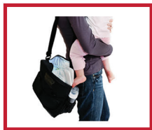
DIAPER BAGS WITH CHILD