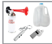
NO NOISEMAKERS NO LASER POINTERS