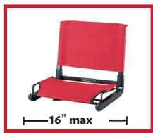
CHAIRBACKS not more than 16" wide