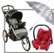
NO STROLLERS, NO BABY CARRIERS, NO UMBRELLAS