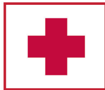
ITEMS RELATED TO A MEDICAL CONDITION

Items prohibited (including, but not limited to): Bags larger than 8.5" x 11" (including backpacks), food, beverages, containers, strollers, baby carriers, umbrellas, laser pointers, banners, flags, signs, noisemakers, nooses, ropes, weapons, replicas of weapons, inflatables, laptops, video recorders, monopods, tripods, selfie sticks, drones or any items deemed dangerous or inappropriate.