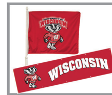
NO FLAGS, BANNERS, SIGNS