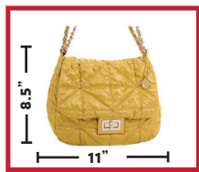
BAGS No larger than 8.5" x 11"