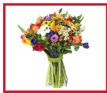
FLOWERS (no glass vase)