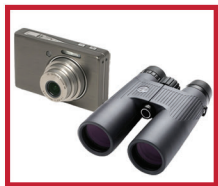
BINOCULARS & CAMERAS