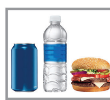
NO FOOD OR BEVERAGES