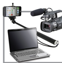
NO LAPTOPS, NO VIDEO RECORDERS NO SELFIE STICKS