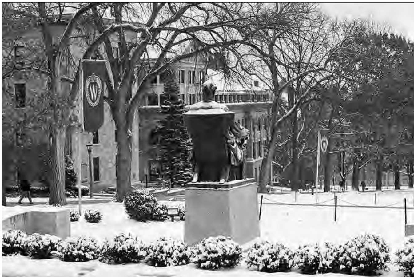
Cover: Science Hall during a winter snowstorm.