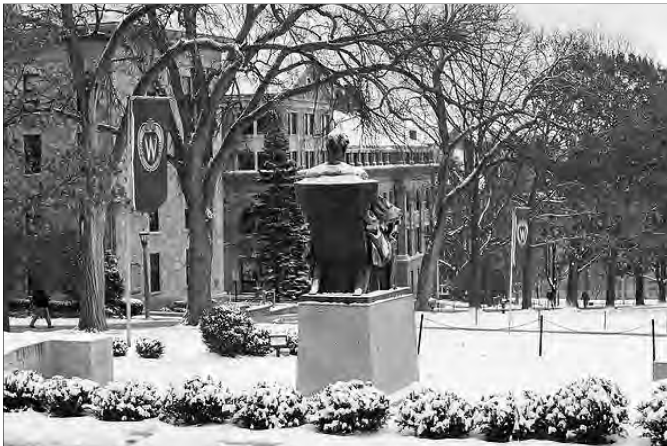
Cover: A fresh coat of snow covers trees and the Carillon Tower.