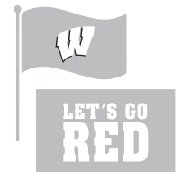
FLAGS, BANNERS, OR SIGNS