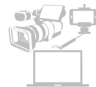
LAPTOPS, VIDEO RECORDERS, OR SELFIE STICKS