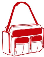
DIAPER BAG (WITH CHILD)