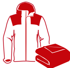
JACKETS & BLANKETS