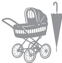
STROLLERS OR UMBRELLAS