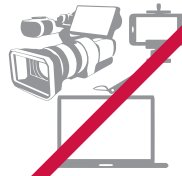
LAPTOPS, VIDEO RECORDERS, OR SELFIE STICKS