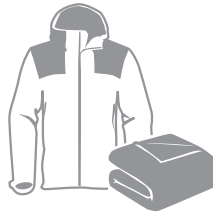
JACKETS & BLANKETS