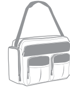
DIAPER BAG (WITH CHILD)